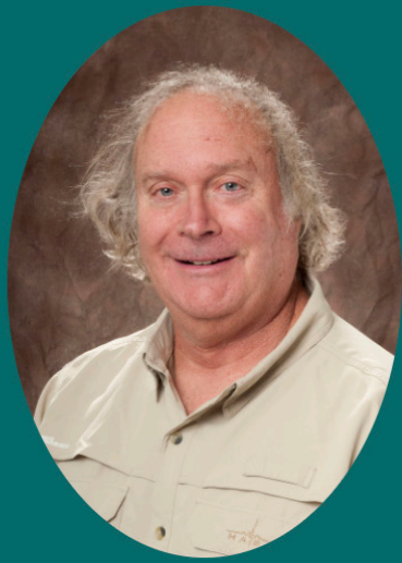
Oz Prim Yadkin Family YMCA