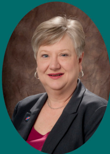
Ruth Dowell Fulton Family YMCA